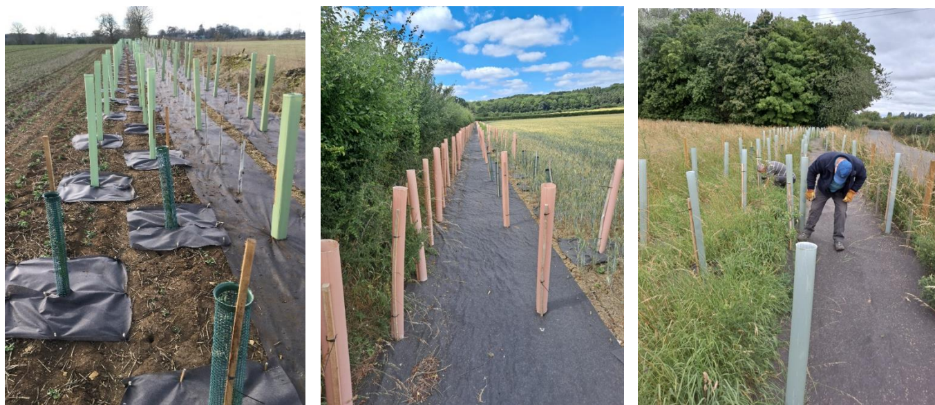
Figure 6: Various tree shelters and weed matting used as tree protection.

With a sensitivity towards existing structures, two of the OSBs were planted against well-developed hedges. For these OSBs, there were only three rows of trees as the existing hedge was adequate to remain as the fourth row. Planting in or against an existing hedgerow is less straightforward than traditional tree planting on farmland. From these experiences the Project team are developing reasonable time planting standards and guarding parameters, which will be published in due course.