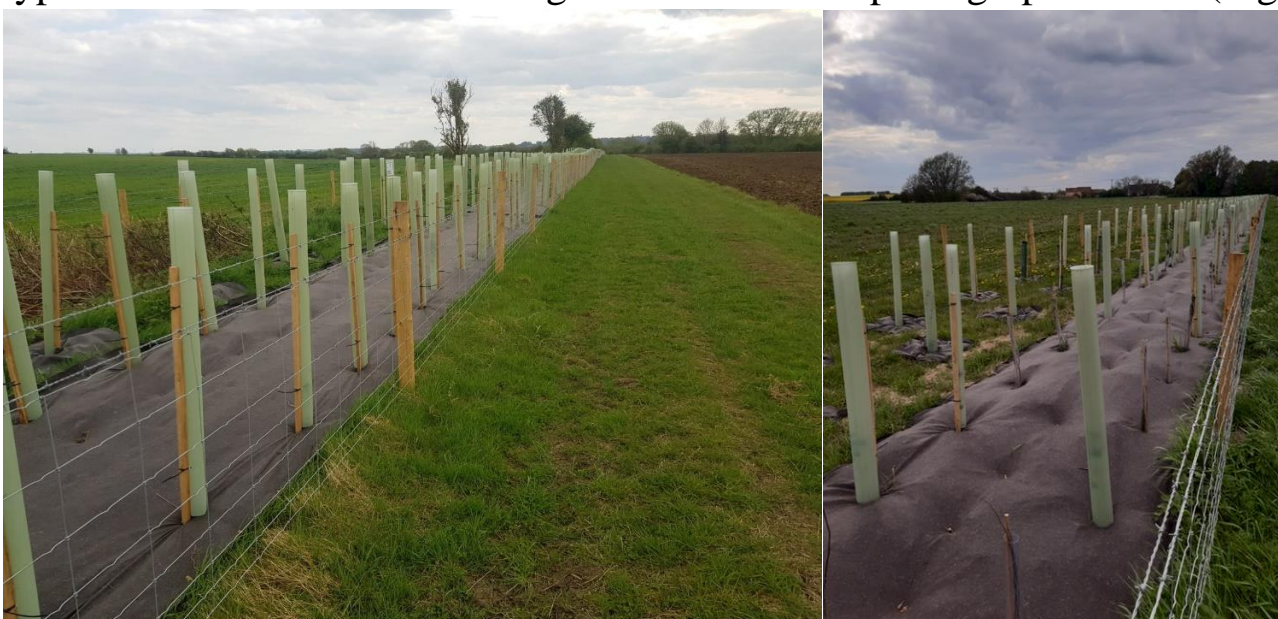
Figure 5 Not much of a hedge to start & existing field boundary (M Jepson)

Selecting the optimum weed control and protection against animal pests is a learning curve for the project. Of the prescriptions tested, the project team's recommendation now is 1.2m bio-degradable guards and Ecotex bio-degradable matting, using the same species and planting layout as originally planned. If possible and wherever there is heavy deer pressure, the project team would now recommend deer fencing. If there is a large amount of tree removal required, chipping is recommended and the woodchip becomes a very effective additional cover if used on top of tree mats. But woodchip alone did not provide an effective way to suppress weed growth. On one farm several hundred tonnes of woodchip alone with spiral guards were used but with no matting and this proved to be ineffective, and weeds grew through varying depths of woodchip applied. Beating up has been 10% overall, but a great deal more on some of the lower guarded specifications, and the 2022 drought has caused further losses. The project team now beat up with 1.2m guards throughout. Some of the different types of tree shelters and matting are shown in the photographs below (Figure 5).