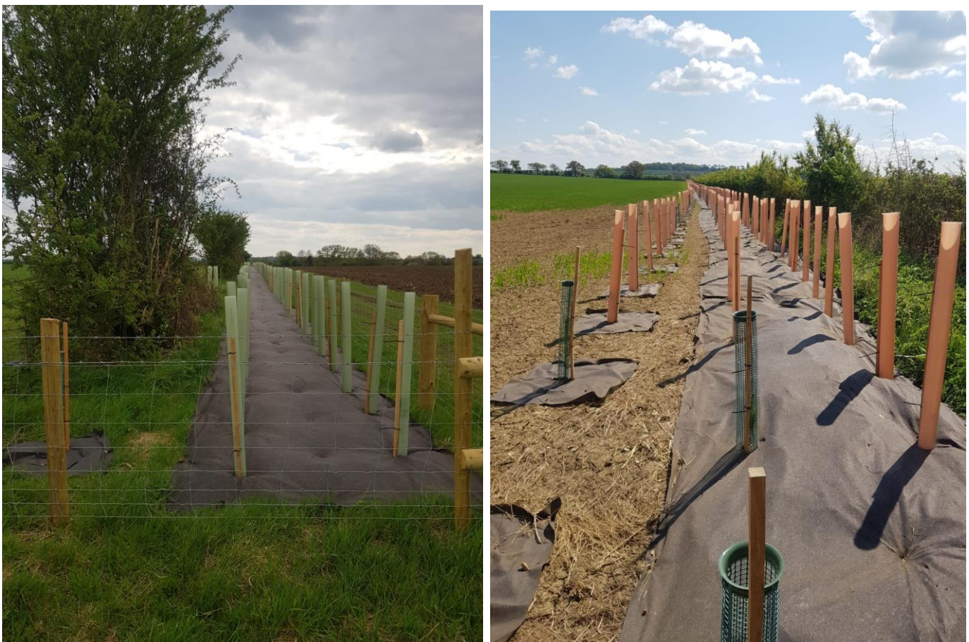
Figure 3 Field Boundary & a windy site for improving yields (B Goldstone)

boundary hedgerows represent those areas of beneficial “non disturbance” of soils. Widening field boundaries to 5 metres and planting carefully selected tree species for both shelter and biodiversity purposes, supports and improves the provision of the habitats offered by the existing hedgerow network, such as it is. Wildlife corridors are becoming the theme of many national biodiversity strategies. Hedgerow shelterbelts can become one of the essential facilitators. There is also emerging advice that for hedgerows to optimise biodiversity, they need to be allowed to grow 10 to 20 metres into the field. The main focus of the OSB initiative is on balancing productivity and environmental benefits with land removed from food production.