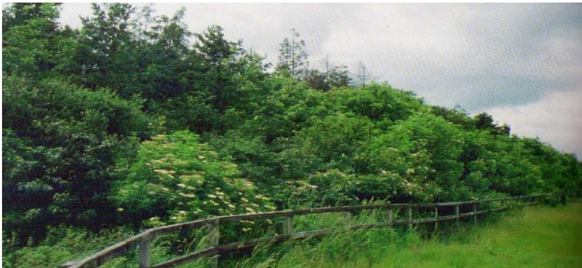
Figure 1: Photograph of a shelterbelt with a sloping profile.

The extent and type of the benefits that shelterbelts can provide, will of course depend on their siting, size and design. This is particularly important when it comes to trying to optimise the reduction of the wind speed. For each shelterbelt, the specific combination of its density, height and leaf distribution and thickness, will influence the reduction in wind speed and turbulence and in turn its shelter performance. The siting, size and width, the choice of species, and their planting density, all influence these characteristics and in turn the effectiveness of the shelterbelt to provide protection from the wind.